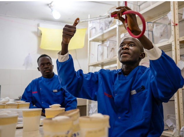
An MRCG researcher in a blue lab coat holds up a glass tube holding mosquitos while his colleague watches.

Giving young children the RTS,S malaria vaccine and antimalarial drugs before the rainy season led to a significant reduction in life-threatening malaria cases and deaths for over five years, according to a landmark study. The results showed the vaccine-drug combination reduced clinical malaria episodes by nearly two-thirds in settings of highly seasonal transmission.