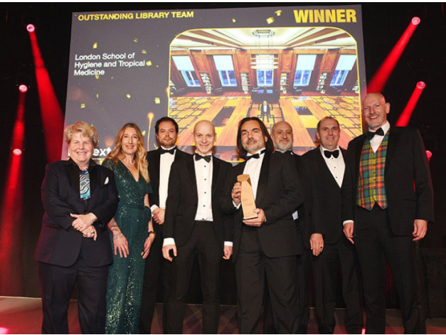
LSHTM Library Team receiving their award on stage

The Library, Archive & Open Research Services team at LSHTM won the Times Higher Education Outstanding Library Team award for going above and beyond to make research more accessible. The team was praised for its open access research and commitment to equity, diversity and inclusion.