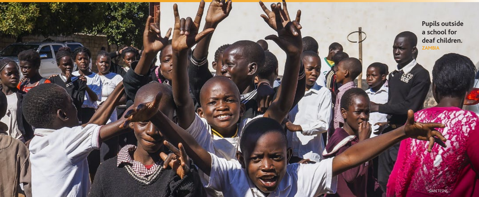
Pupils outside a school for deaf children. ZAMBIA