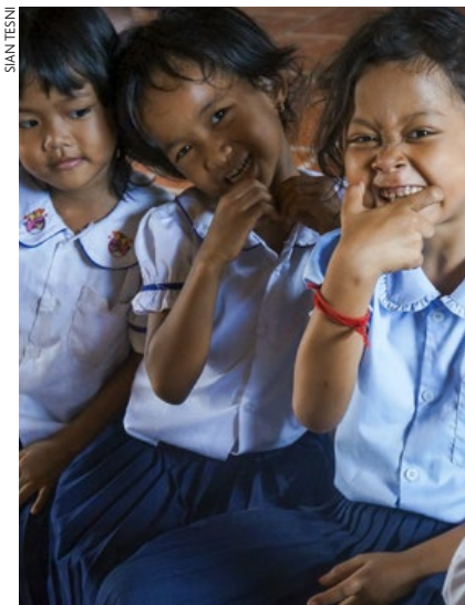
Children attending an inclusive pre-school.

Disability, and with it hearing impairment, is now a question of human rights. As stressed by Kcat (page 9), people with hearing loss live in the same world that everyone lives in. They must have equal access to it.