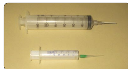
Fig. 1: Disposable syringes

Chronic discharging ears are still common problems in the community in the developing world and are main features of chronic suppurative otitis media. An important part of the treatment of this condition is cleansing of the ear (aural toileting), either by ear syringing or mopping with cotton wool swabs, followed by aural wick dressing with antibiotic ear drops. Antibiotic or antiseptic applications into the ear canal have no chance of getting where they are required if the meatus is still full of pus. This is a frequent cause of failure of treatment if the aural toileting is not done prior to commencement of treatment.