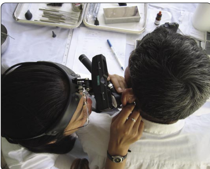
Ear examination in Kampong Chhnang

Unfortunately, population demographics in Cambodia are such that accessibility to most specialist health services remain a critical problem. Predominantly rural with one of the lowest population densities in Asia, only a minority of the Khmer population is urbanised (~18% of a total population of 13.8 million), the majority