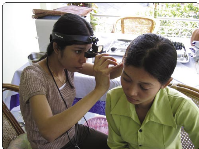
Aural cleaning in Kampong Chhnang