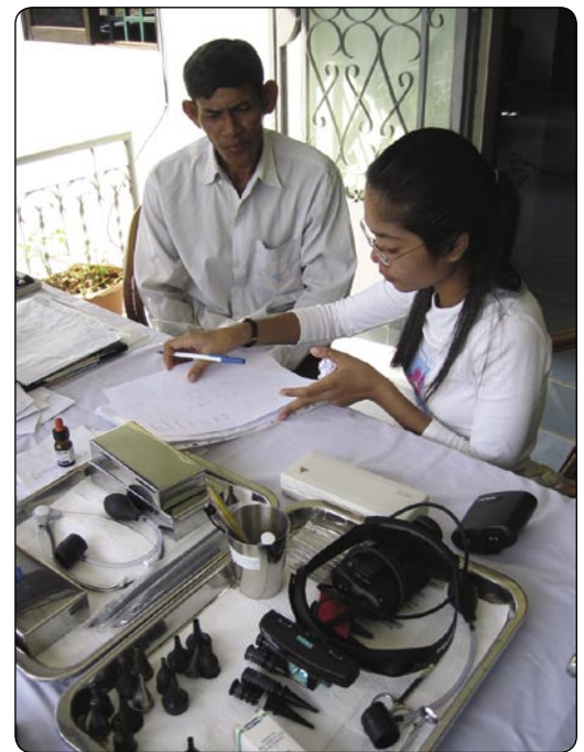
History taking in Kampong Chhnang

The present cost of appropriate hearing aids is prohibitive for the majority of the Khmer people. In addition to the shortages and high prices, there is a huge lack of services to fit hearing aids and ear moulds correctly and very few trained personnel. In Cambodia, as in many parts of the developing world, strategies for the procurement and