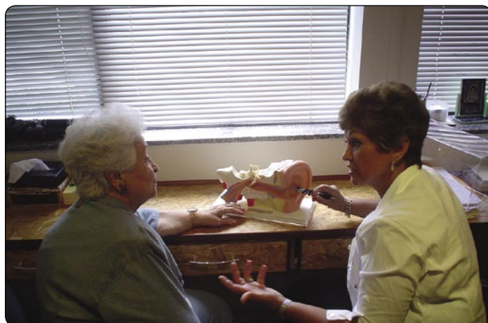
Explaining the function of the ear