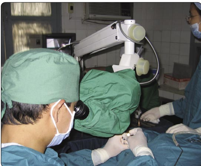
Mastoid surgery in Preah Ang Duong Hospital, Phnom Penh

Clearly, the development of human resources is a fundamental pre-requisite for the development of these services. Accordingly, appropriate training has been given to two Khmer nationals, by resident and visiting specialist consultants. All Ears Cambodia has also provided training for PEHC staff working for other NGOs. There has been the development of training and teaching materials towards the provision of PEHC education and secondary/tertiary lines of treatment of HI and ear disease. This health-orientated education project is conducted at outreach level and aimed at health field staff, teachers, parents of hearing impaired children, and local communities.