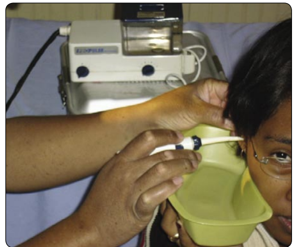
Fig. 3: Using an electric ear syringe