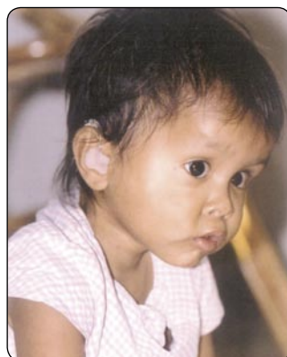
Visually impaired orphan with severe sensorineural hearing loss at the 'All Ears Cambodia' Clinic in Phnom Penh