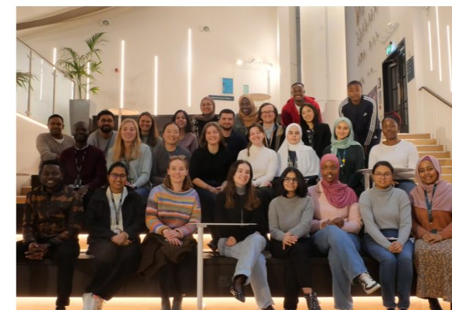
Above: LSHTM Telephone Campaign Team 2025