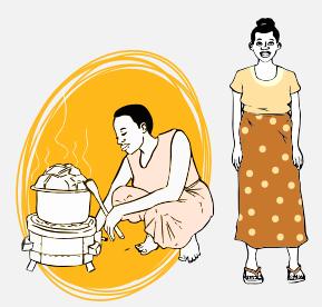
Domestic workers are particularly high risk, with 1 in 2 young girls employed in domestic work reporting violence in the workplace in the past year.