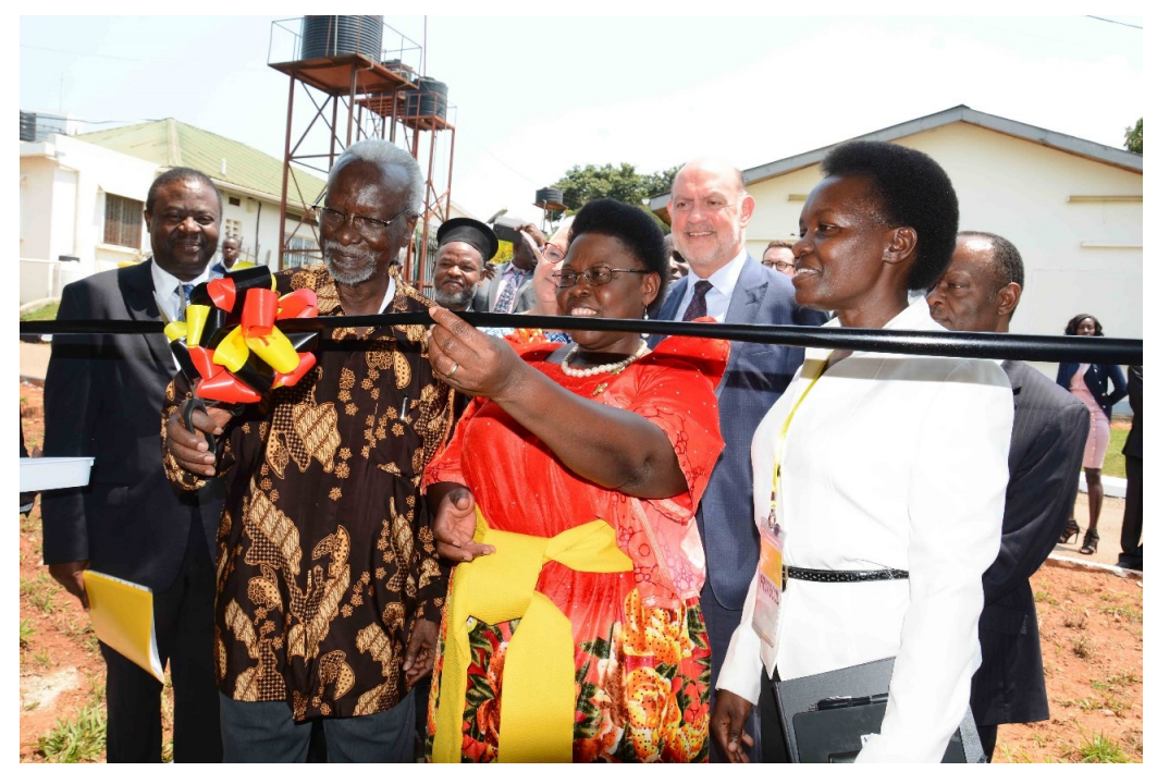
Hon. Kirunda Kivejinja, Second Deputy Prime Minister and Minister of East African Community Affairs who represented the Guest of Honor. His Excellence Yoweri Museveni and Dr. Moriku Joyce the Minister of State for Primary Health Care cut tape to commemorate the official opening of the insectary.

On 29th July 2019, the Uganda Virus Research institute (UVRI) in collaboration with Target Malaria Prof Pontiano Kaleebu said the Institute's aim is Uganda officially opened a new Arthropod Containment Level 2 (ACL-2) insectary at the UVRI campus, Entebbe. The new insectary will be used for future genetically modified mosquito experiments under containment. This will allow the further development of Target Malaria's activities in Uganda.