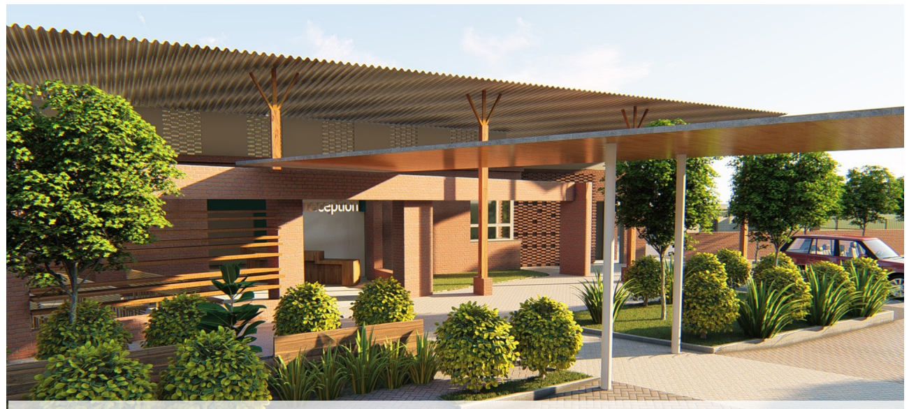
An artist's impression of the Clinical Research Centre that is under construction in Entebbe

Construction work has started on the first phase of a state-of-the-art Clinical Research Centre at the Entebbebased UVRI campus.