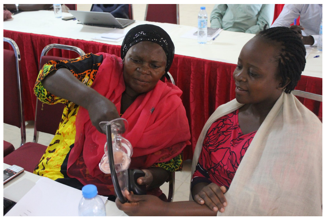
A participant at the Masaka stakeholders' dissemination workshop tries her hand at a dummy that was used to illustrate insertion and removal of the ring.

66 If this vaginal ring is finally licenced for wider use, I know many women will like it because it gives one peace of mind. You have it in, go about vour business without interference and when it is time for sex, you don't have to ask the man if he agrees to use it or not. I can tell you; this product will put our lives in our hands" ... (observed one women rights activist).