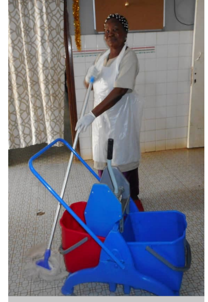
'Cleaning Champions' practice good IPC after training in The Gambia.

Health teams and labour ward staff from the six participating facilities attended a 4-day IPC intervention training workshop led by Soapbox and Horizons. The workshop enabled facilities to address some of the challenges identified in the needs assessment by equipping them with the knowledge and skills to revise and strengthen existing hygiene policies and practices to support quality care for mothers and their newborns.