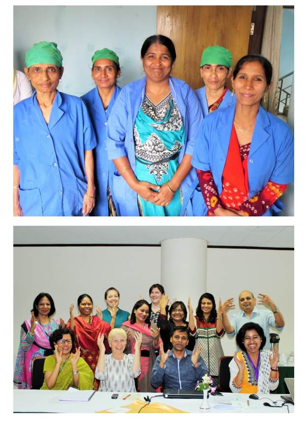
(Top) Interviews with cleaning staff explored their perceptions of hygiene & IPC (Bottom) WASH & CLEAN dissemination meeting, Bangladesh, 2014