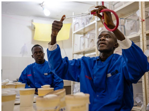
An MRCG researcher in a blue lab coat holds up a glass tube holding mosquitos while his colleague watches.

Giving young children the RTS,S malaria vaccine and antimalarial drugs before the rainy season led to a significant reduction in life-threatening malaria cases and deaths for over five years, according to a landmark study. The results showed the vaccine-drug combination reduced clinical malaria episodes by nearly two-thirds in settings of highly seasonal transmission.