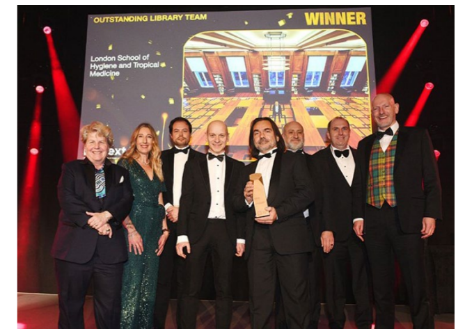
LSHTM Library Team receiving their award on stage

The Library, Archive & Open Research Services team at LSHTM won the Times Higher Education Outstanding Library Team award for going above and beyond to make research more accessible. The team was praised for its open access research and commitment to equity, diversity and inclusion.